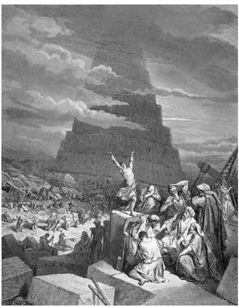
Scattering humans across the planet, God changed our "tongues" creating ethnic groups and languages.

The saddest thing about it all is that none of us has done any better than Adam or Eve. For each one of us at some time in our life, young or old, has chosen to sin against what God has put in our consciences. None of us