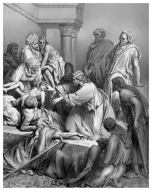
".. And he touched them and they were healed "

Another thing which God's Holy Spirit does is that He pours God's love into a believer's heart, and motivates them to do good things for