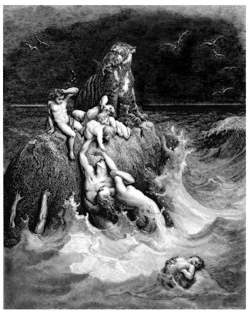
There was no where to escape to. The Flood finally covered everything.

With "The Flood". everything about the Earth changed. The protecting layer of water that was above the atmosphere, had come down in the deluge of Now UV radiation rain. could get through. The Continents were soon to split up and move apart. Ice caps were to form. And the kind of weather we know